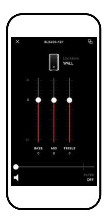
Or control your loudspeaker and subwoofer levels individually