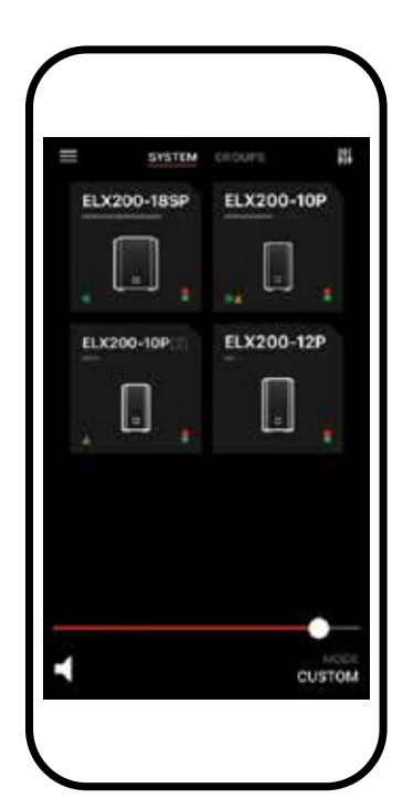
Configure your system setup